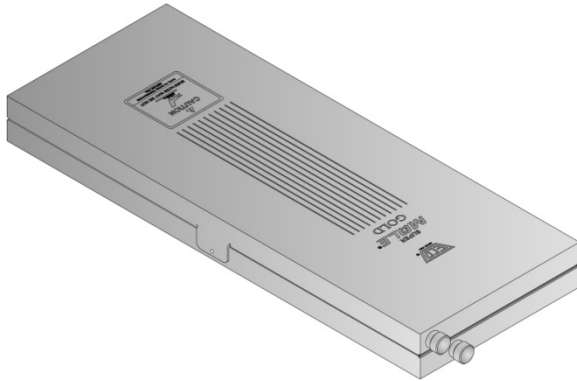
M.O.L.E.® Thermal Barrier (Part Number: E42-0901-80)