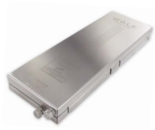
Figure 1 – External View