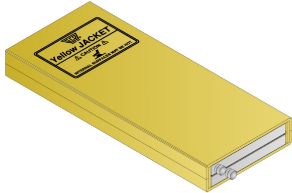
M.O.L.E.® Thermal Barrier w/Yellow Jacket (Part Number: E44-0944-80)