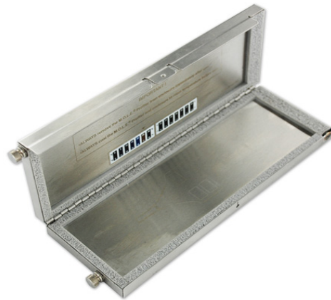
Figure 2 – Internal View